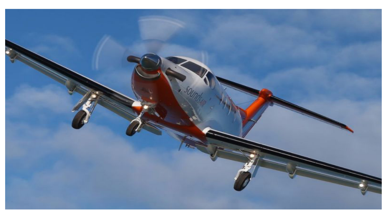
Images: Flights from Wānaka to Christchurch will be on a nine-seater turbo-prop Pilatus PC12 aircraft.

Tickets are now on sale for a new flight service between Wānaka and Christchurch.